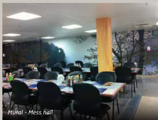
Mural - Mess hall

These components may apply to the mess hall, pantry, gym, corridors, conference room, leisure room and TV room.