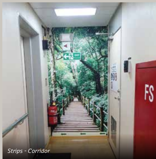
Strips - Corridor

ADDMORESHERE ENHANCES COMFORT ONBOARD WITH DECORATIVE SOLUTIONS COMPLIANT TO SAFETY STANDARDS