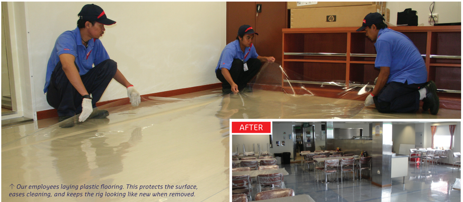
↑ Our employees laying plastic flooring. This protects the surface, eases cleaning, and keeps the rig looking like new when removed.