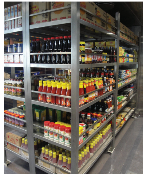
↑ With our global supplier contacts, we can pre-stock goods at lower prices.