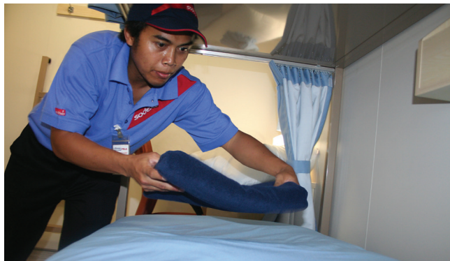
↑ We fit out and prepare the living quarters so that it is ready to be used.