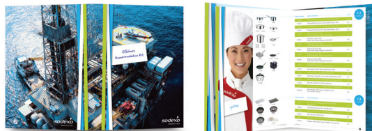
↑ Offshore Accommodation Kit catalogue