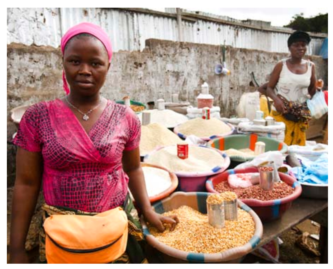
So dexo\ supports\ women-owned\ businesses\ to\ improve\ production\ quality\ and\ maintain\ standards\ to\ satisfy\ clients.