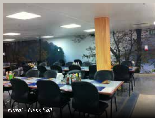
Mural - Mess hall

These components may apply to the mess hall, pantry, gym, corridors, conference room, leisure room and TV room.